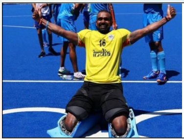
Rtn P R Sreejesh of Rotary Club of Kizhakkambalam, District 3201 was the goalkeeper of Indian hockey team which won the bronze medal at the Tokyo Olympics. Sreejesh was the star of the game with two penalty corner saves in the last 50 seconds.